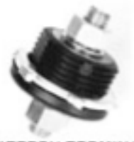
BATTERY TERMINAL FEED-THRU