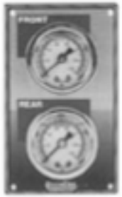
MINI BRAKE BIAS GAUGE