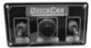
STD. IGNITION SWITCH W/ ACC. SWITCH