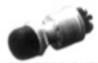
HD STARTER BUTTON BUTTON