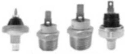
SENDING UNITS 15# OIL PRESSURE 230 WATER TEMP 275 OIL TEMP 4# FUEL PRESSURE