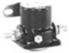
HEAVY DUTY STARTER SOLENOID