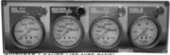
QUICKCAR 4 GAUGE LITE NITE PANEL QUICKCAR 4 GAUGE OP/WT/OT/FP QUICKCAR 4 GAUGE LQ OP/WT/OT/FP **AVAILABLE WITH OR WITHOUT AUTO-METER GAUGES