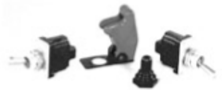
MOMENTARY TOGGLE SWITCH SINGLE POLE SWITCH SWITCH ON-OFF-ON SWITCH DOUBLE POLE CROSSOVER