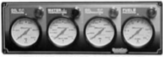
STEWART WARNER GAUGE PANEL