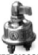
MASTER DISCONNECT SWITCH ONLY SWITCH W/ALT