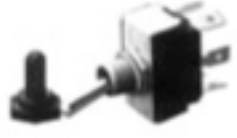
HD MAGNETO SWITCH SWITCH W/BOOT REPLACEMENT BOOT