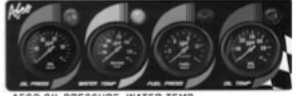
AFCO OIL PRESSURE, WATER TEMP AFCO OIL PRESSURE, WATER TEMP, OIL TEMP AFCO OIL PRESSURE, WATER TEMP, FUEL PRESSURE AFCO OIL PRESSURE, WATER TEMP, OIL TEMP, FUEL