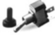
HD IGNITION/ACC SWITCH SWITCH W/BOOT REPLACEMENT BOOT