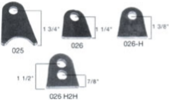
CHASSIS TABS 3/16" STEEL - 1-3/4" FROM CENTER RADIUS TO CENTER OF HOLE - FITS 1-1/2" TUBING. A - 1/2" HOLE B - NO HOLE C - 3/4" HOLE D - 3/8" HOLE 1/2" HOLE - 1-1/4" FLAT TO CENTER OF HOLE A - 3/16" STEEL B - 1/8" STEEL C - NO HOLE - 3/16" STEEL HEAVY DUTY CHASSIS TAB - 1/4" STEEL 1-3/8" FLAT TO CENTER OF HOLE. A - 1/2" HOLE B - 3/4" HOLE