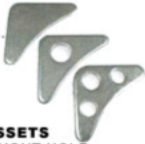
GUSSETS WITHOUT HOLE WITH ONE HOLE WITH THREE HOLES