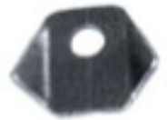
TRICK TAB 1/8" STEEL 7/16" HOLE 1/8" STEEL 3/8" HOLE 1/8" STEEL 1/2" HOLE 1/8" STEEL 1/4" HOLE