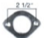
UNDER BAR FLANGE 1-1/2" DIA CENTER HOLE 7/16" SMALL HOLES. 1/4" STEEL 3/16" STEEL