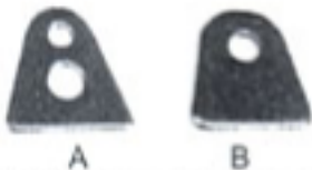
WINDOW FRAME TABS 3/16" HOLE -16 GA. STEEL 1" X 1" STEEL 1" X 1" ALUM 3/4" X 3/4" STEEL 3/4" X 3/4" ALUM