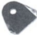
BODY TABS .085 STEEL 1/4" HOLE .085 STEEL 3/8" HOLE FLAT (SPECIFY HOLE SIZE) .125 STEEL 1/4" HOLE