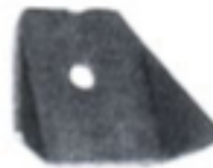
BODY TABS .085 STEEL 1/4" HOLE .085 STEEL 3/8" HOLE FLAT (SPECIFY HOLE SIZE) .085 STEEL 1/2" HOLE .085 STEEL NO HOLE