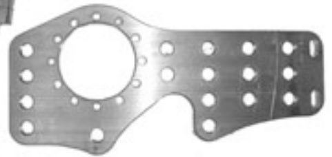
LONG PINION MT. PLATE