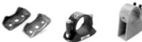
LEAF SPRING PLATES WELD ON FOR 3" AXLE TUBE CLAMP ON FOR 3" TUBE ALUMINUM CLAMP ON PAD