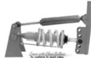
AFCO IMCA SPRING LOADED TORQUE LINK