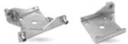
LOWER SPRING PLATES 2-POSITION CO LH STEEL CO RH STEEL