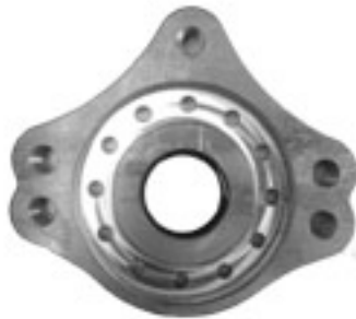
PINION MT. PLATE W/SEAL