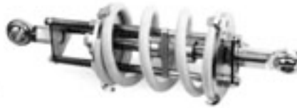
TWO WAY TORQUE LINK