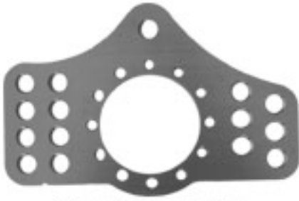
PINION MT. PLATE